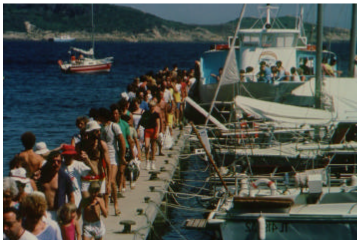
Seaside activities are major source of ecosystem disturbance.

sources of disturbance to fauna (monk seal, turtles), direct mortality by boats (turtles, sharks), and degradation of certain marine biocenoses (caves, by diving).