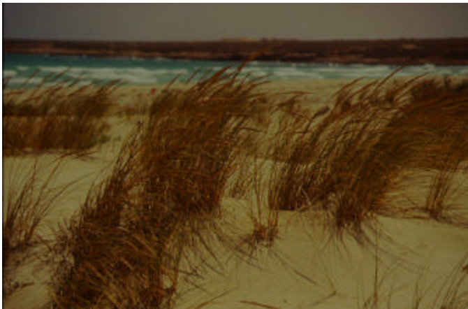
The plant formations stabilize the dunes and the beaches. M.N. Bradai

The main disturbance of the sandy environments comes from work done to develop tourist activity. Infrastructure development is the main threat hanging over sandy coastal environments. In countries where tourist development is rapid and uncontrolled, the littoral dunes constitute deposits of sandy material for building work. Removal of the sand brings about the disappearance of the plant formations that stabilize the dunes, which thus become vulnerable to erosion by water and – especially – wind. Dune environments, easily worked by public works equipment, are also choice environments for building the transport and accommodation infrastructure of seaside resorts. Channels that communicate with wetlands are also places that attract the building of sea walls and ports.