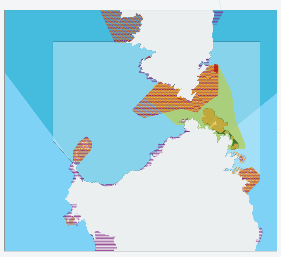
Overlap of different designations in the Bonifacio Strait

Moreover, all of these designations have different names with differing attached meanings, a fact which is magnified by the sheer number of spoken languages around the Mediterranean.