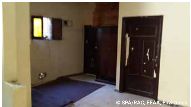
Poor standard of rooms in the hotels