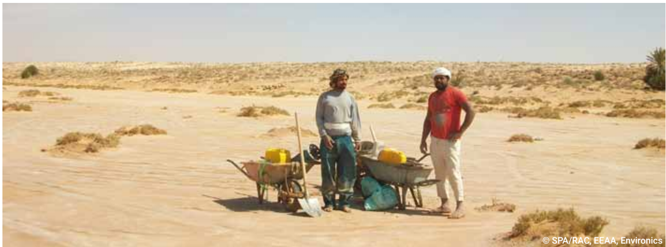
Figure 21: Preparation of the trap basins 'Bardeya'