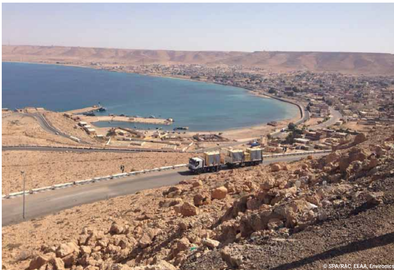
Figure 10: Salloum City

Salloum center (Markaz) and City is affiliated to Marsa Matrouh Governorate, which is located to the West of Alexandria Governorate on the Egyptian Border with