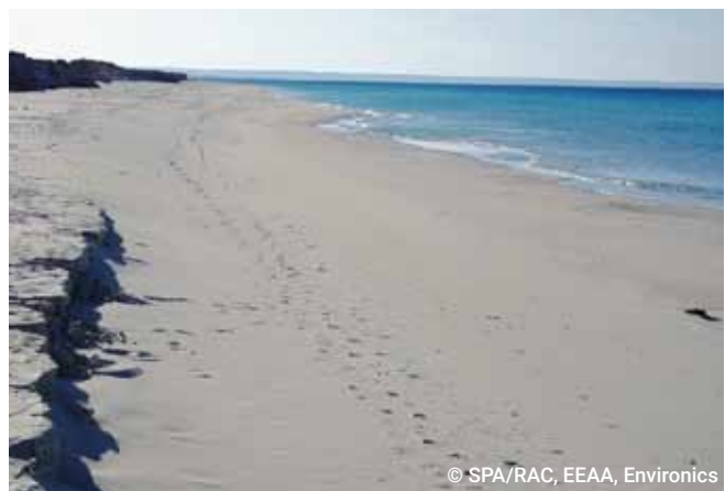
Figure 2: Site Visit