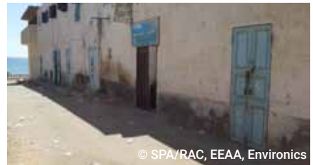
El Wehda El Arabeya Hotel