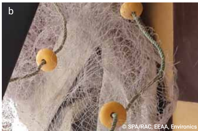
Figure 17: Fishing gill nets used for fishing