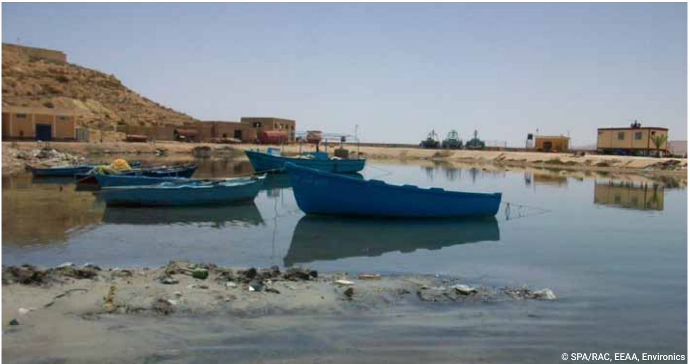
Figure 16: Smaller fishing feluccas