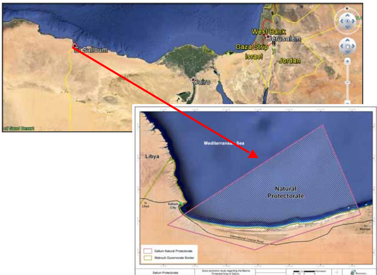
Figure 1: Salloum MPA boundaries