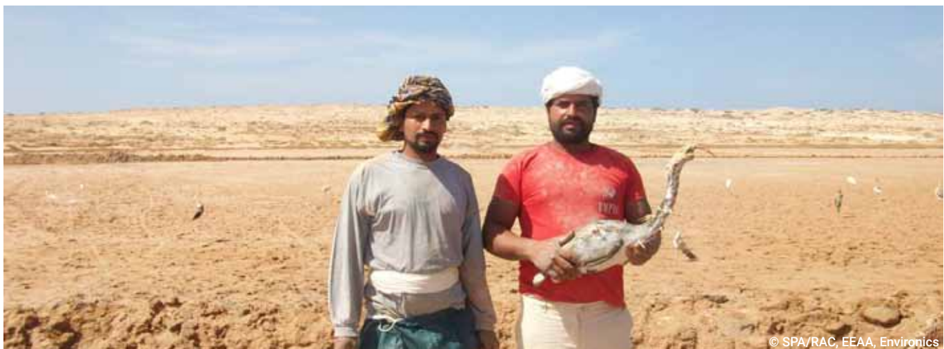
Figure 22: Artificial birds used to trick migrant birds