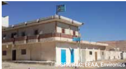
Beb Elbahr Hotel