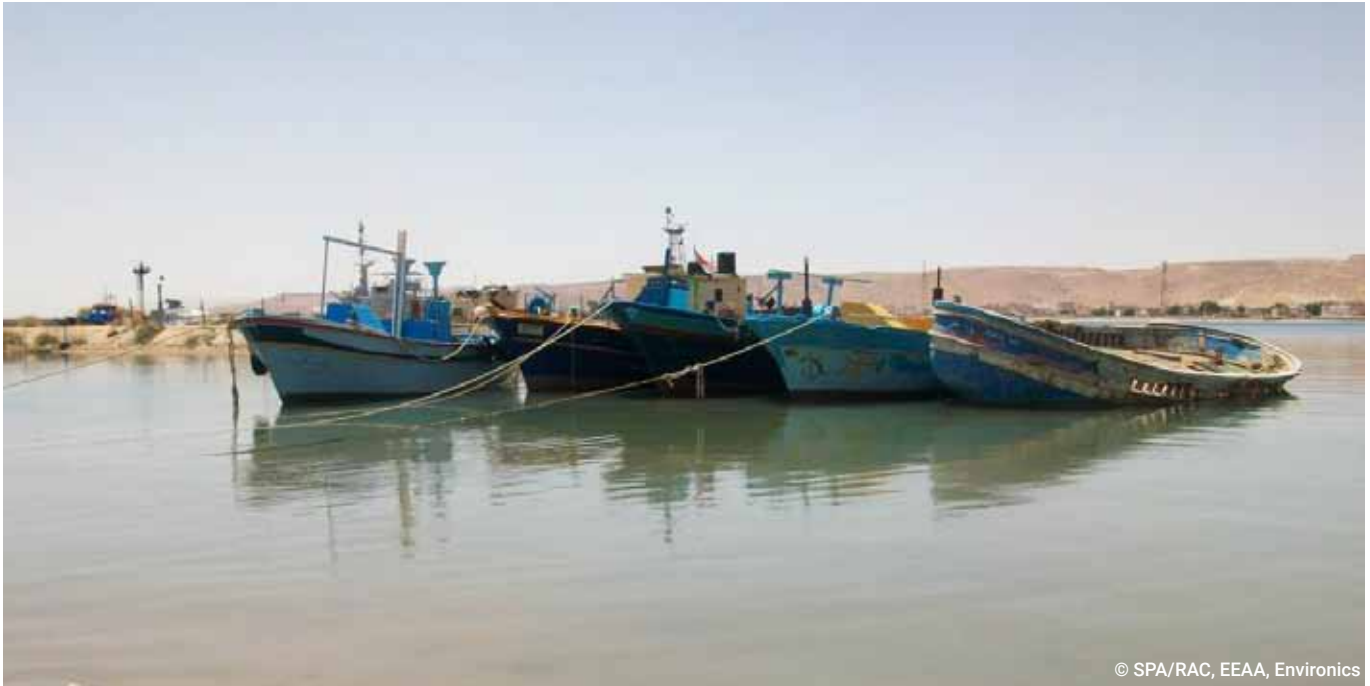
Figure 15: Medium sized fishing motor boats

to 20 km off shore. The smaller feluccas are about 4 m long and 2 m wide with a capacity of 3 fishermen. These boats can only steer on shore. All boats and fishermen are licensed; however due to security and safety purposes, overnight fishing is prohibited for all boats and fishermen. Hence, fishermen can leave the gill nets in the water overnight and collect it in the morning.