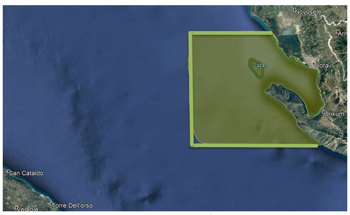
Figure 2: Proposed Study area of Vlora, Albania

The area also includes Vlora Commercial and Fishing Port