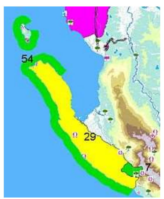
Figure 3: Coverage area (in green) of the Karaburun-Sazan marine park

The area also includes Vlora Commercial and Fishing Port