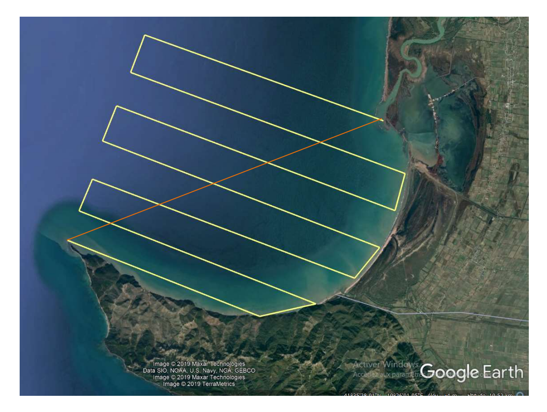
Figure 6: Proposed Transects for field survey within Patok-Rodoni Bay

The minimum requirements expected of the ROV are: