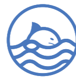
Cartilaginous fishes (Chondrichthyans)