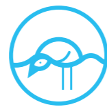
Marine and coastal bird species

Listed in Annex II of the Protocol concerning Specially Protected Areas and Biological Diversity in the Mediterranean