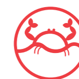
Species introduction and invasive species

Habitats and species associated with seamounts, underwater caves and canyons, aphotic hard beds and chemo-synthetic phenomena