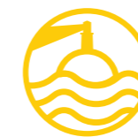
Specially Protected Areas

Listed in Annex II of the Protocol concerning Specially Protected Areas and Biological Diversity in the Mediterranean